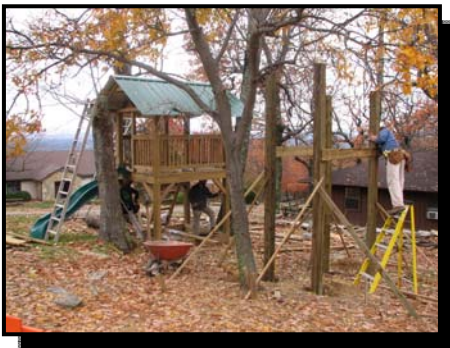
Playground under construction.