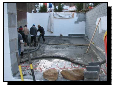
Basement concrete slab being poured.