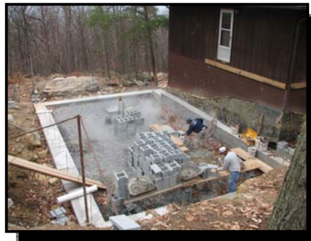
Block foundation walls for addition being laid.